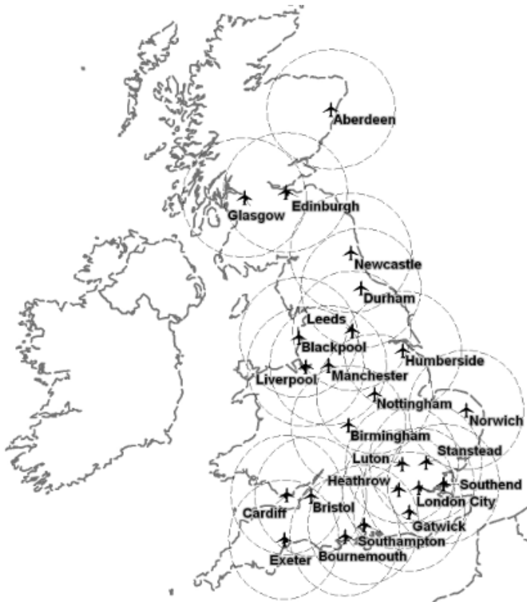
Figure 1. UK Airports' catchment areas

area in order to identify the overlapping areas where airports compete with each other. Figure 1 shows how airports in southern UK have more overlapping catchment areas than those in the north; residents in southern UK thus potentially enjoy a wider choice of airports: the ensuing higher degree of substitutability is likely to enhance the competitive pressures for southern airports.