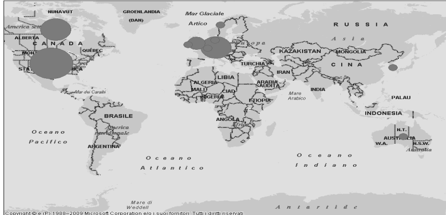
Fig. 1- Geographical areas studied.